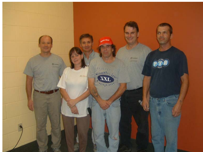
Southwire Canada was gracious enough to send a team out for a second day of painting to complete the job!