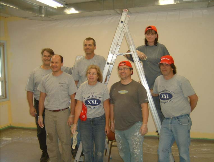
The Southwire Canada Team's first day of painting YRFN's new offices.

Thank you Southwire Canada and Allstate Canada!