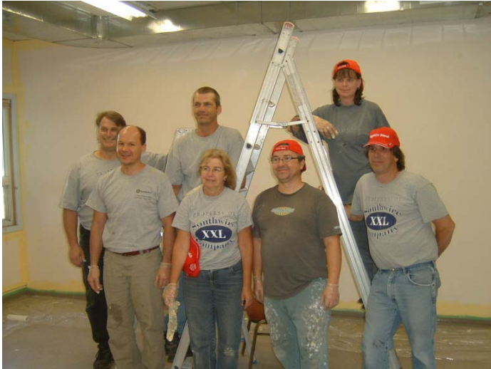
The Southwire Canada Team's first day of painting YRFN's new offices.

Thank you Southwire Canada and Allstate Canada!