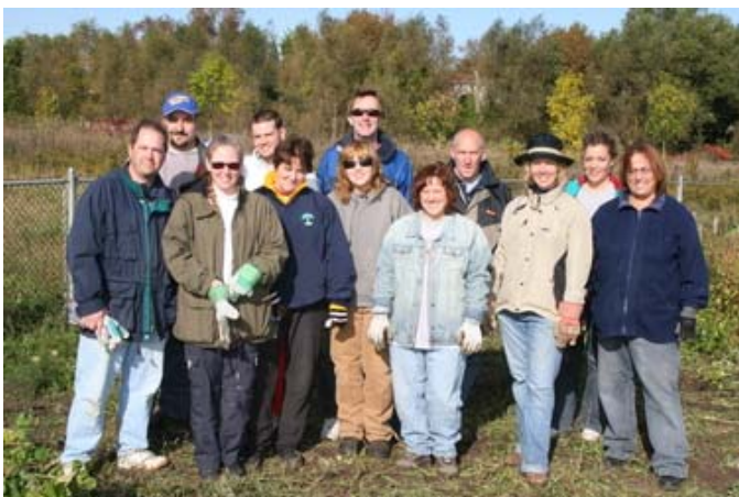
The Allstate Canada Team help prepare the Newmarket Community Garden for its move to the Magna Centre in the spring of 2009.

The Aurora Community Garden has staked claim to a new site for the 2009 growing season. We are now located on Town property just north of Aurora Cornerstone Church, 390 Industrial Parkway South.