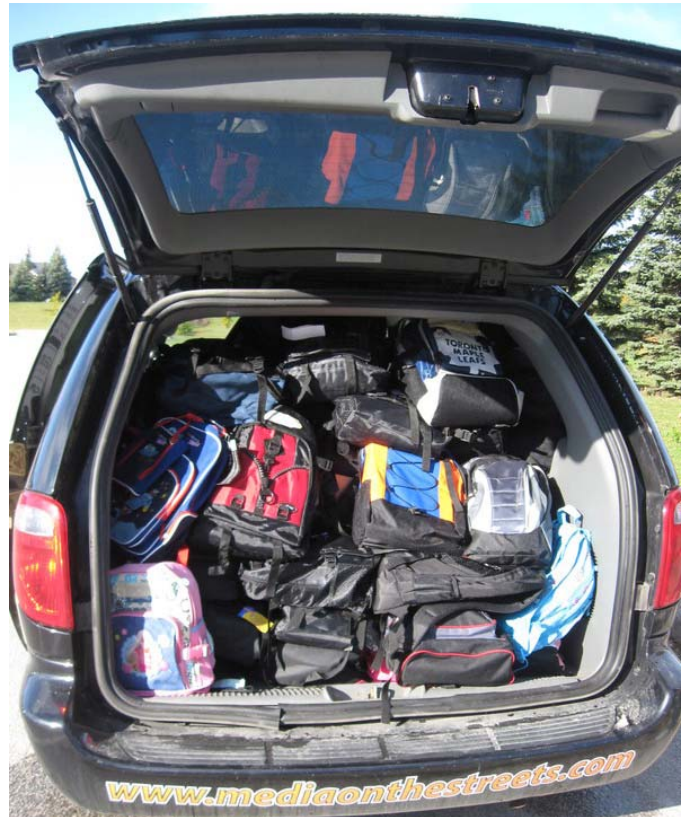
Backpacks ready for delivery to food banks

YRFN applauds the support provided by corporations, community groups and local residents. Over the past five years their contributions have made a difference. In 2008 alone, 529 children felt that difference.