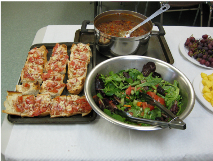
Just one of many delicious meals cooked up in our Community Kitchen program

Cooking Healthy Together is a monthly program that brings people together to prepare and share a healthy meal. Participants learn basic cooking skills, prepare healthy & affordable recipes, plan meals and practice safe food handling and preparation. Each of the sessions is facilitated by a Nutrition Educator with York Region Community & Health Services.