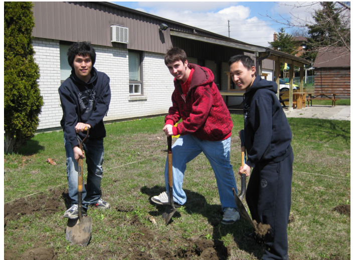
Students from Pickering College assist in preparing the York Region Food Network garden plot.

RSVP: kima@yrfn.ca or 905-967-0428 ext 201