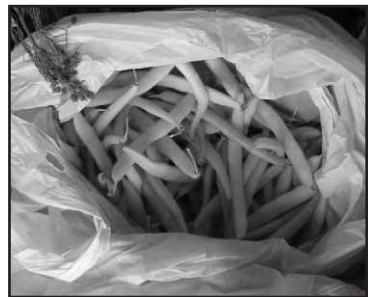
Community Garden Donation to the local Food Bank

In May the three gardens opened to the enthusiasm of 142 families and 4 service groups. That same month the Backyard Gardening Kit program expanded to include Woodbridge and Richmond Hill participants. The Food Network was delighted to receive funding to hire a summer student who assisted the Community Garden Coordinator with various garden related projects.