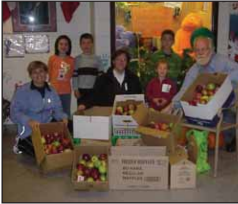
Food Bank Support