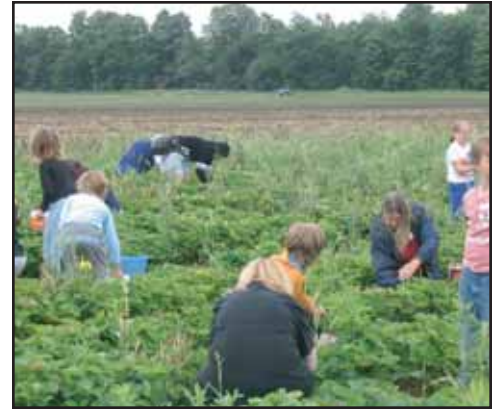
Fresh Food Partners: Gleaning Program