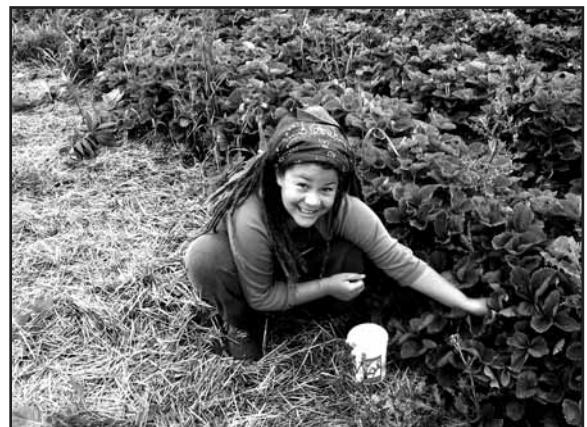
Gleaning Trip Participant

In 2004, with the support of YRFN, Fresh Food Partners hosted nine gleaning trips. Over 215 people participated and they gleaned over $5000 of fresh produce that would have otherwise gone to waste or plowed under.