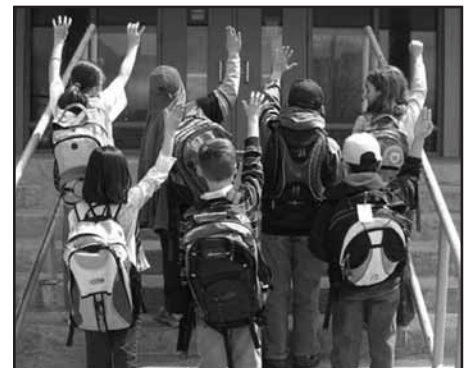
Back to school program.

With financial support from the Community Development Investment Fund (CDIF), YRFN piloted a back to school backpack program. This initiative provided basic school supplies, directly to low income children through the food banks. Highly successful, the backpack program increased the self-esteem and confidence of at-risk children, reduced financial and emotional stress for parents unable to provide